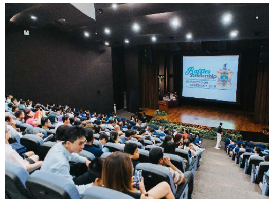
2019 Raffles Scholarship Award Ceremony (Primary 5 and 6) at Raffles Institution

The Year 1 to 6 Scholarships complements MOE's Independent School Bursary Scheme, and UPLIFT Scholarship, providing additional financial support to RI students from economically disadvantaged backgrounds, to cover their out-of-pocket school expenses. This enables them to participate fully in the whole range of developmental programmes, co-curricular activities and exposure trips at RI, together with their schoolmates.