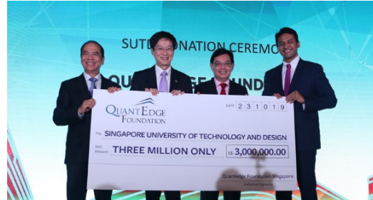
Announcement of gift to establish the Quantedge Foundation – SUTD Opportunity Grant at SUTD's 10 th Anniversary Fundraising Dinner

Similar to SMU Access, eligibility for Quantedge Foundation – SUTD Education Opportunity Grant is based only on the student's household economic circumstances. All students who meet the household income and dwelling criteria are assured of a financial aid package that makes their entire undergraduate education free.