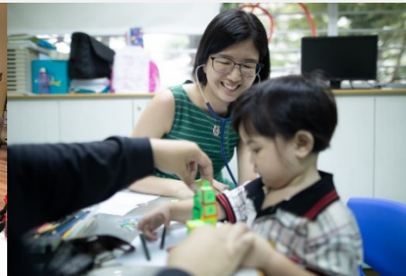
Health and development screenings at CoC partner pre-schools