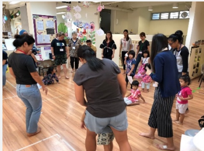
BLOOM parent-child workshops in partnership with Chapter Zero.

Since 2018, Quantedge Foundation has been co-funding Phase 3 of Circle of Care with Lien Foundation and Care Corner Singapore. Phase 3 will target children from birth to 9 years and is expected to expand its reach from the existing 10 pre-schools to 30 pre-schools and 7 primary schools across three community clusters by 2023.