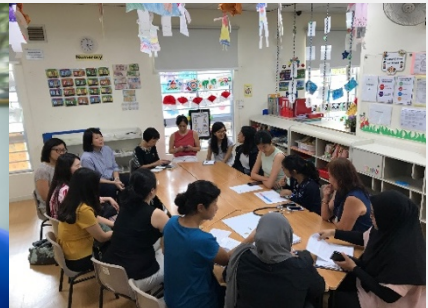
Inter-disciplinary team meetings to discuss progress of CoC children