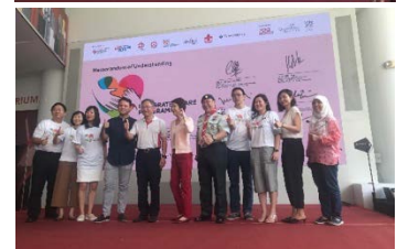
ICP@SW Launch Ceremony on 7 Sep 2019